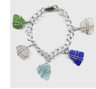
Sterling Silver Bracelets in blue-green, brown, kelly, olive green, white, multi Spring or Fall seaglass, or gray seastones: