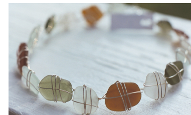
Sterling Silver Full Necklace with brown, kelly, olive green, white or multi Spring or Fall seaglass or gray seastones: