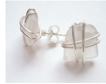
Sterling Silver Earrings in blue-green, brown, kelly, olive green, white seaglass, or gray seastones: